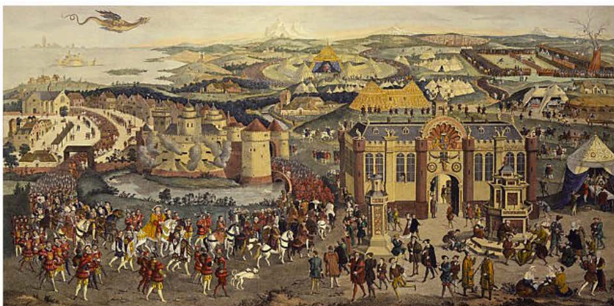
English school, The Field of the Cloth of Gold , v.1545. Royal collection (Hampton Court)

In 1520, from the 7th to the 24th of June, a famous meeting took place between François I and Henry VIII, near Calais in France. The aim of this encounter was diplomatic and it was the subject of a luxury competition on the part of both kings, in order to impress each other. The name "Field of the cloth of gold" has remained in history because of the gigantic camp that was set up for this meeting (600 to 700 tents), some of which (François I's tent for example) are covered with precious textiles such as cloth of gold.